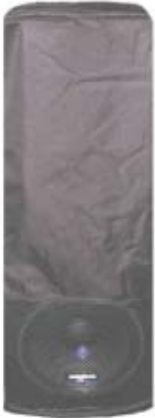
Simple slip over design