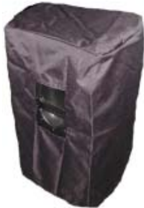
Easy access to built-in handles for one person transportation