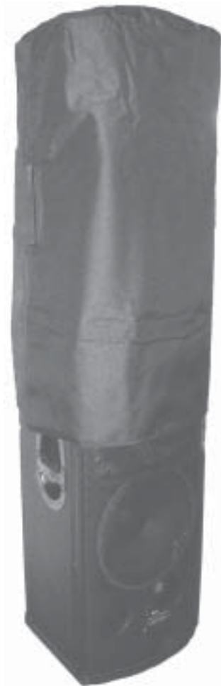
Simple slip over design