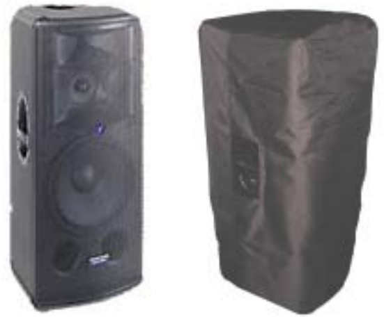
Padding on all five sides