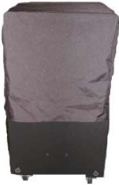
Simple slip over design