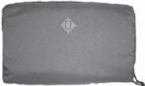
Double zipper pulls for easy access