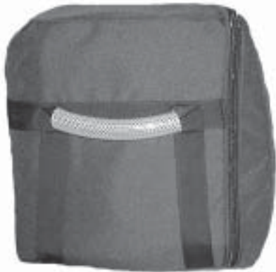
Reinforced carrying handles for one person transportation