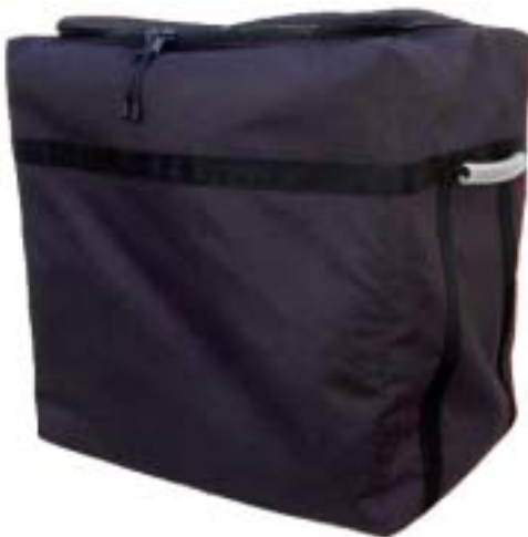
Double zipper pulls for easy access