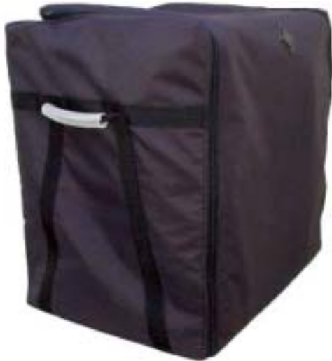
Reinforced carrying handles for one person transportation